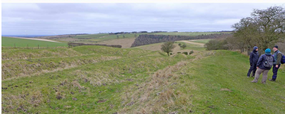
Top - the group at Hanging Grimston (Dave Went), bottom - the central section of Huggate dykes (Becca Pullen)

The first stage of the Research Framework for the Archaeology of the Extractive Industries in England has been completed with the publication of The Archaeology of Mining and Quarrying in England: a research framework . Written by LSG member Phil Newman it will be available in a high resolution form in due course but it can be downloaded in two parts, each about 5MB, from the NAMHO website at http://www.namho.org/research.php .